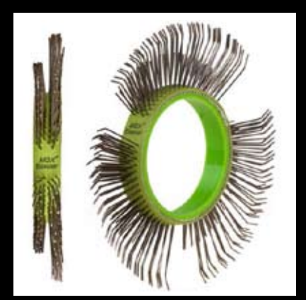
Belt for MBX<sup>®</sup> Die Blaster<sup>®</sup>, 11mm, <u>Left:</u>