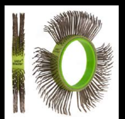
Belt for MBX® Die Blaster®, 11mm: