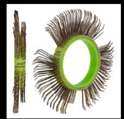
Belt for MBX<sup>®</sup> Die Blaster<sup>®</sup>, 11mm, <u>Right:</u>